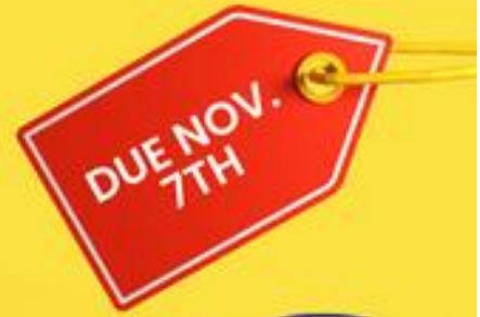
Photo Story ART Poetry